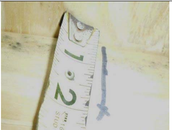
Roof deck attachment